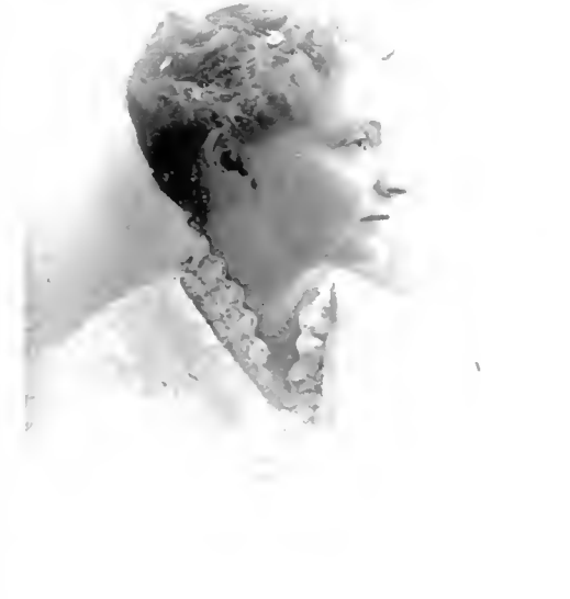
ANNIE SMITH PECK.